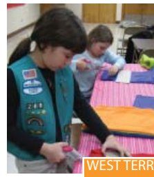
WEST TERRACE GIRL SCOUTS