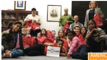
AMERICAN RED CROSS